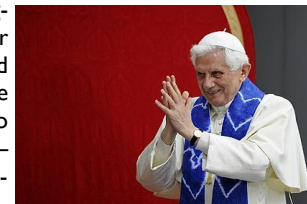
Pope Benedict visits the United Kingdom

reality to the one in England. Well, this is not entirely so! Thankfully, it is true that Christian roots are deeply rooted in our culture. However, this does not mean that there is no attempt from some, to put forward arguments in favour of the margination of the catholic religion, and who are ready to do everything to silence the voice of the Church. Each year we exchange Christmas greetings. It is indeed sad to see Christmas cards without any reference to the birth of Christ. Are we also, perhaps, being influenced by this new culture that seeks to eliminate or marginate the role of the Catholic Religion in our country?!.. A Happy Christmas to you all!