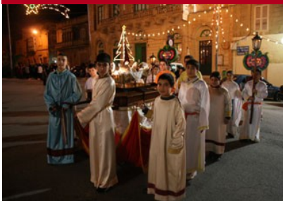
Route of this year's procession